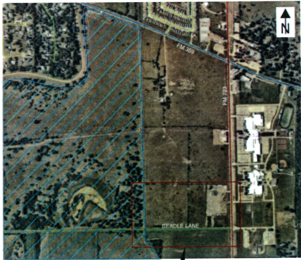
EXHIBIT A Road Maintenance Limits