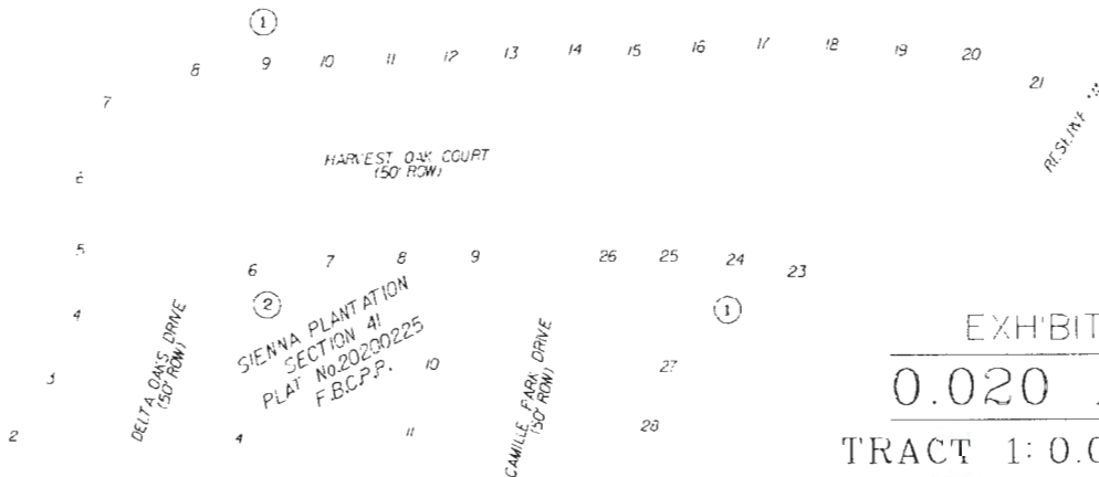
EXHIBIT OF 0.020 ACRE

WATERS LAKE BLVD. SECTION 2 PLAT No. 201400000 F.B.C.P.R.