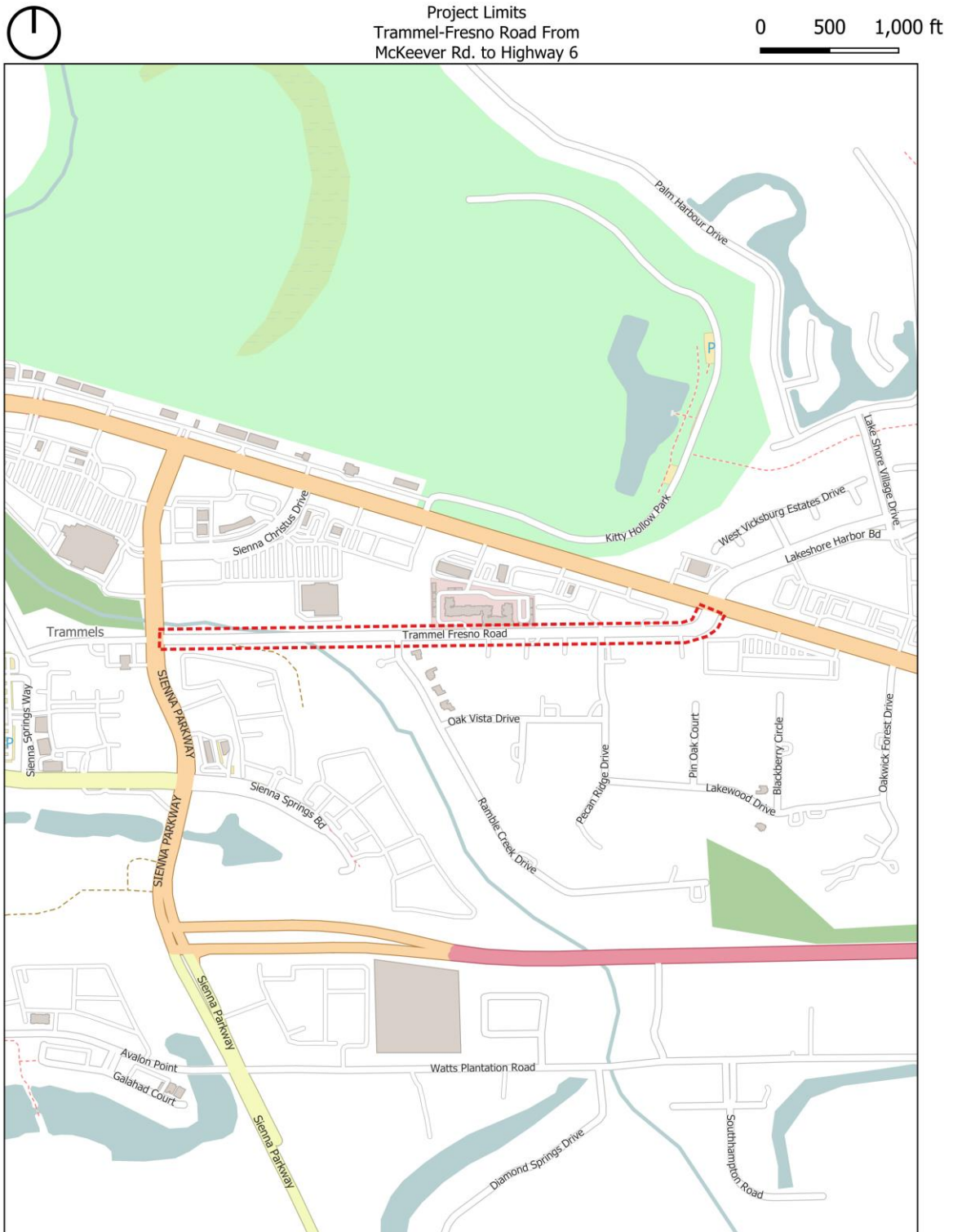
Exhibit A – Project Limits