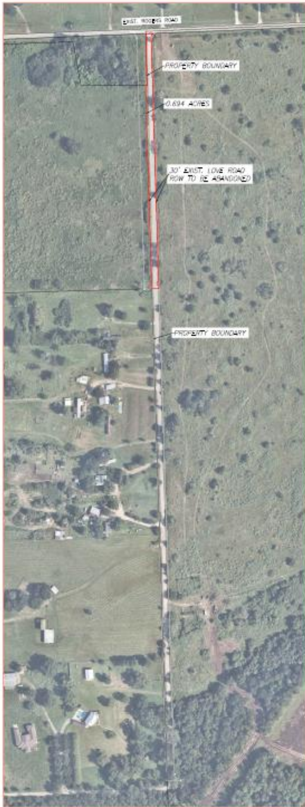
Exhibit F Abandoned Love Road