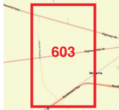
Key Map Location

CSJ: 0912-34-217 NBI: 12-080-0-AA0860-001 Location: Randon School Rd at Coon Creek Description of Work: Replace Bridge and Approaches Entity: Fort Bend County