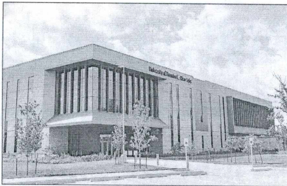
University of Houston-Clear Lake at Pearland

To register for the Drone Academy, visit www.uhcl.edu/drone-academy . For more information about the university, visit http://www.uhcl.edu .