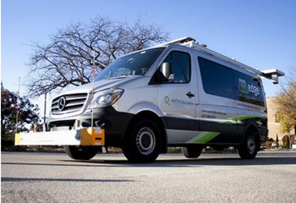
Figure 2. The EDGE data collection vehicle.

profile (IRI or roughness), and collects forward and rearward facing right-of-way (ROW) images. All data for one lane is collected in a single pass at approximate roadway speeds, eliminating any need for traffic control. There is no exposure of operators to the driving public, making data collection safer for all parties. All data is geo-referenced, and a distance measurement instrument (DMI) is used to increase the location accuracy.