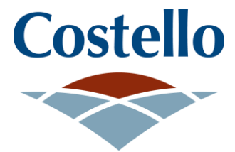
EXHIBIT "A" RATE SCHEDULE January 2017

Below are hourly rates for various job classifications. The billing rates are based upon a multiplier times salary cost. Salary Cost is defined as direct salary plus 40% for customary and statutory benefits such as social security contributions, unemployment, payroll taxes, worker's compensation, sick leave, vacation and holiday pay. A multiplier of 2.50 is used to obtain billing rates, except for field survey crews which are fixed rates per hour.