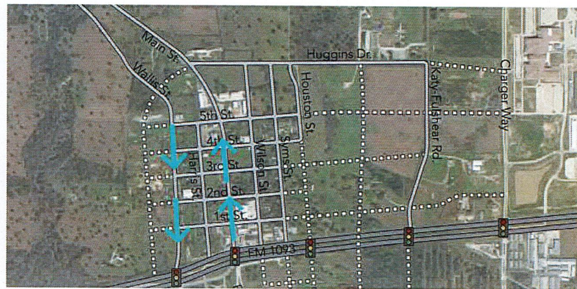
One-way pair utilizing Main and Wallis Streets