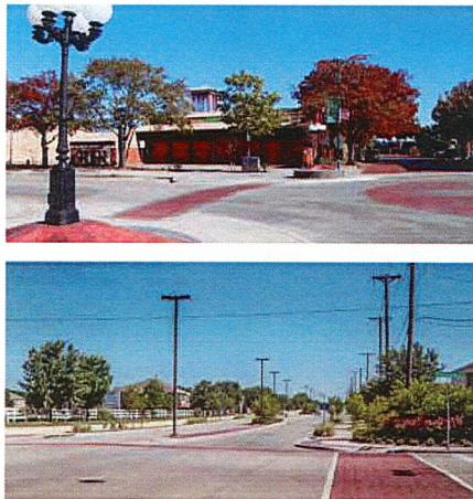
Examples of Enhanced Intersections