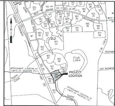
VICINITY MAP SCALE: 1" = 2000' KEY MAP NO. 566 H&M

I, GARY D. NUTTER, AM REGISTERED UNDER THE LAWS OF THE STATE OF TEXAS TO PRACTICE THE PROFESSION OF SURVEYING AND HEREBY CERTIFY THAT THE ABOVE SUBDIVISION IS TRUE AND ACCURATE, WAS PREPARED FROM AN ACTUAL SURVEY OF THE PROPERTY MADE UNDER MY SUPERVISION ON THE GROUND, THAT, EXCEPT AS SHOWN ALL BOUNDARY CORNERS, ANGLE POINTS, POINTS OF CURVATURE AND OTHER POINTS OF REFERENCE HAVE BEEN MARKED WITH IRON (OR OTHER OBJECTS OF A PERMANENT NATURE) PIPES OR RODS HAVING AN OUTSIDE DIAMETER OF NOT LESS THAN FIVE EIGHTS (5/8) INCH AND A LENGTH OF NOT LESS THAN THREE (3) FEET AND THAT THE PLAT BOUNDARY CORNERS HAVE BEEN TIED TO THE TEXAS COORDINATE SYSTEM OF 1983, SOUTH CENTRAL ZONE.