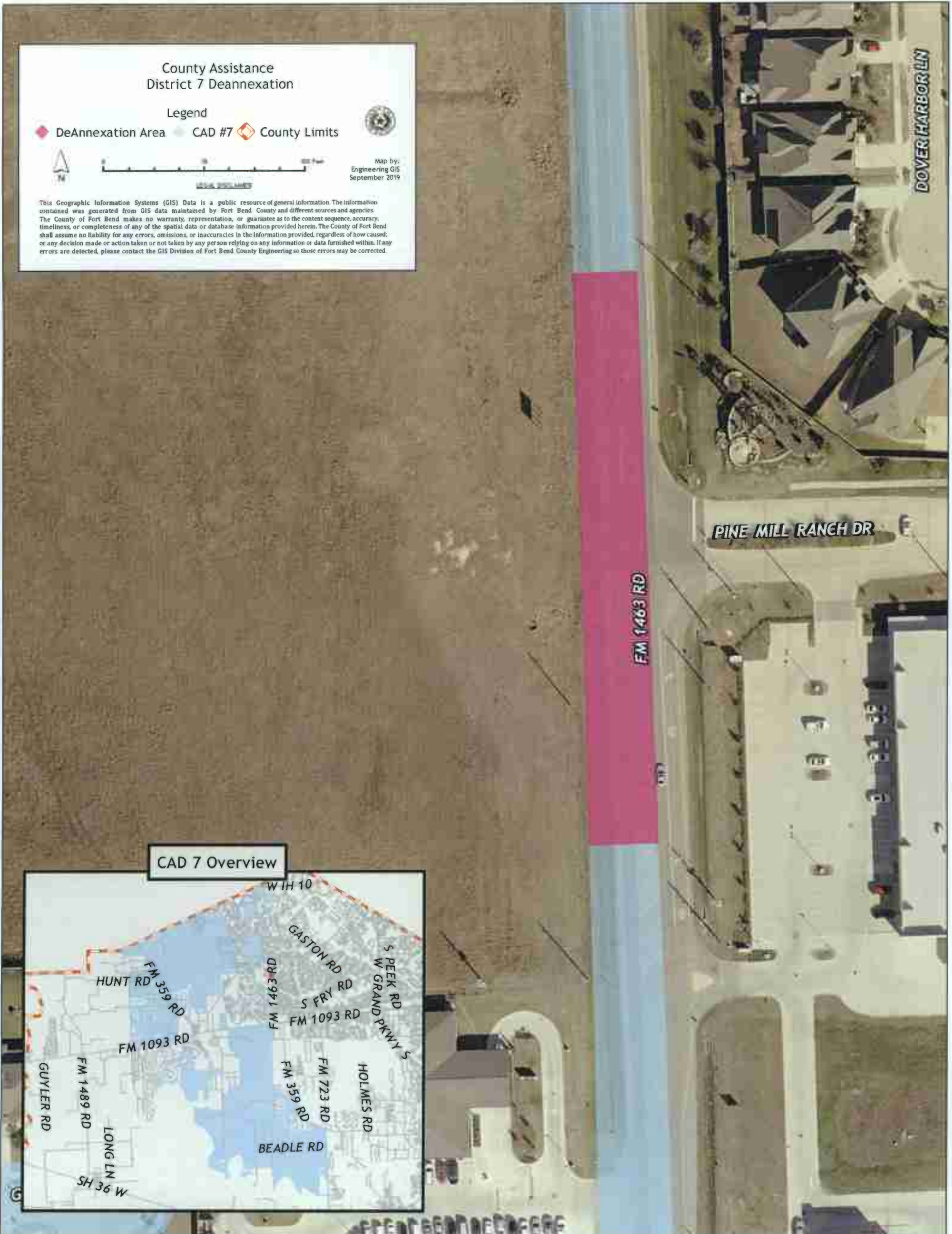
CAD 7 Overview

This Geographic Information Systems (GIS) Data is a public resource of general information. The information contained was generated from GIS data maintained by Fort Bend County and different sources and agencies. The County of Fort Bend makes no warranty, representation, or guarantee as to the content, sequence, accuracy, timeliness, or completeness of any of the spatial data or database information provided herein. The County of Fort Bend shall assume no liability for any errors, omissions, or inaccuracies in the information provided, regardless of how caused; or any decision made or action taken or not taken by any person relying on any information or data furnished within. If any errors are detected, please contact the GIS Division of Fort Bend County Engineering so those errors may be corrected.