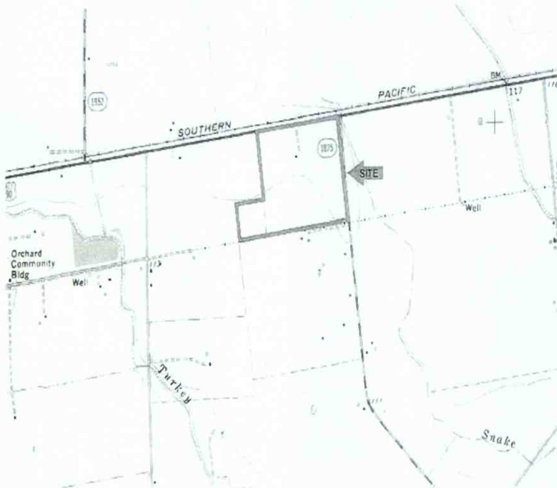
Exhibit B – Map

RECORDER'S MEMORANDUM This page is not satisfactory for photographic recordation due to carbon or photo copy, discolored paper, etc. All block-outs, additions and changes were presented at time instrument was filed and recorded.