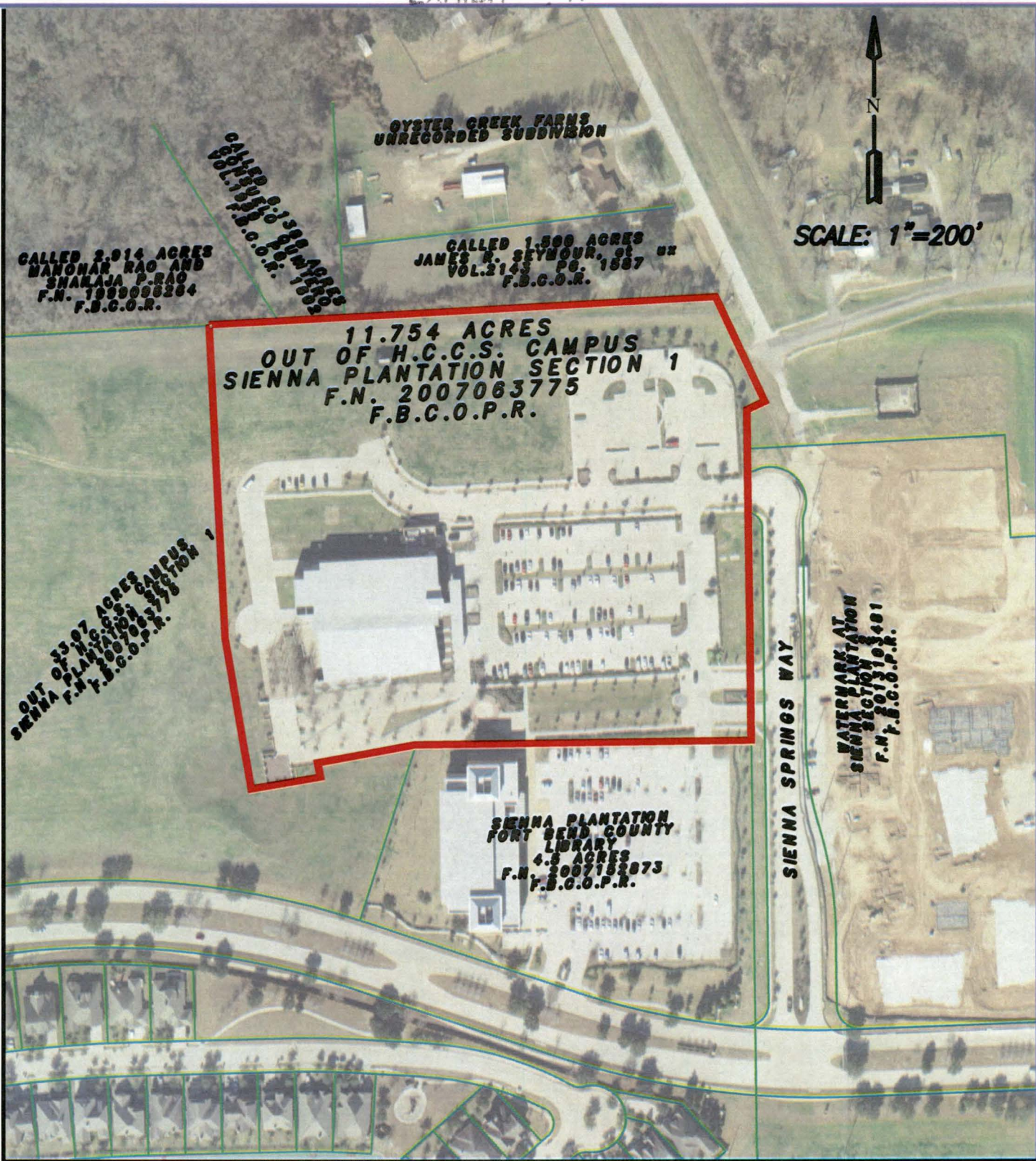
EXHIBIT OF OUT OF DISTRICT SERVICE AGREEMENT FOR 11.754 ACRES TRACT