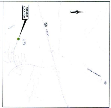
PROJECT LOCATION KEY: 1/4" = 100' MAP