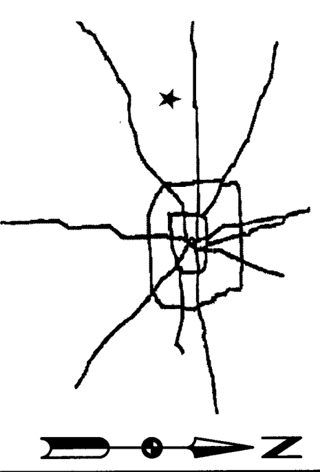
LOCATION MAP SCALE : N.T.S.