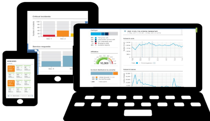
Figure 1-1: MyView Portal offers real-time, role-based access to critical network and services information.

To provide Fort Bend County with quick access to service details, Motorola Solutions will provide our MyView Portal online network information tool. MyView Portal provides our customers with real-time critical network and services information through an easy-to-use graphical interface.