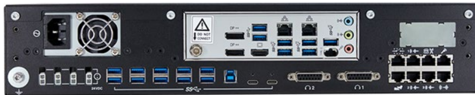
CommandCentral Hub (Rear View)

The CommandCentral Hub (CC Hub) supports the MCC7500E dispatch client as an alternative to the USB AIM module. The CC Hub contains a number of analog inputs and outputs for connecting various peripheral devices as well as a workstation class computer motherboard. This eliminates the need to purchase an external PC when using the CC Hub. Each CC Hub supports one MCC7500E dispatch client.