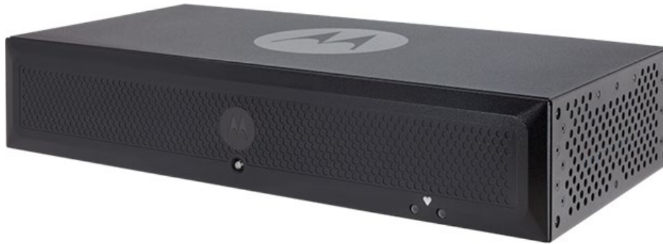
CommandCentral Hub (Front/Side)

The CommandCentral Hub (CC Hub) supports the MCC7500E dispatch client as an alternative to the USB AIM module. The CC Hub contains a number of analog inputs and outputs for connecting various peripheral devices as well as a workstation class computer motherboard. This eliminates the need to purchase an external PC when using the CC Hub. Each CC Hub supports one MCC7500E dispatch client.