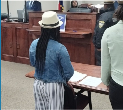
Justice of the Peace Precinct 2