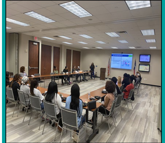
Health & Human Services Lunch & Learn