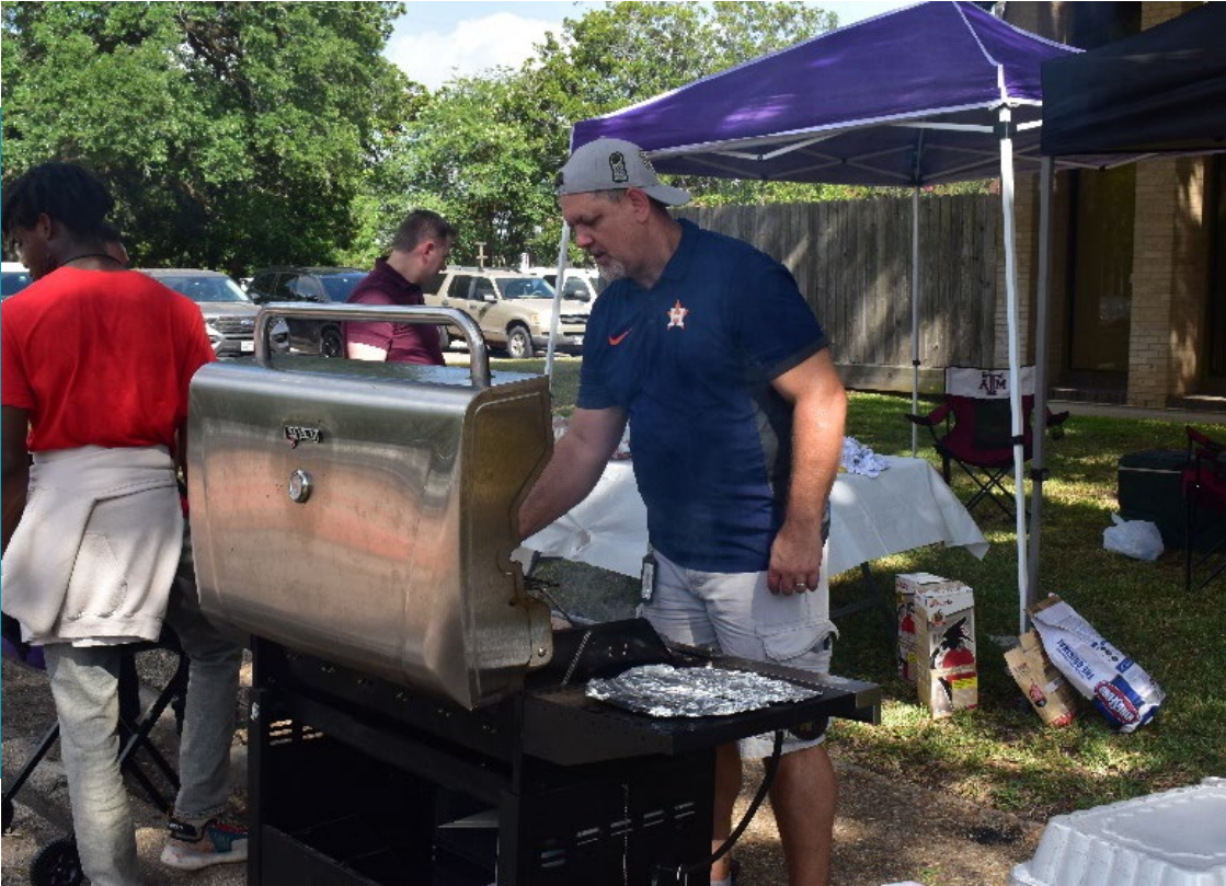
Information Technology End of Year BBQ