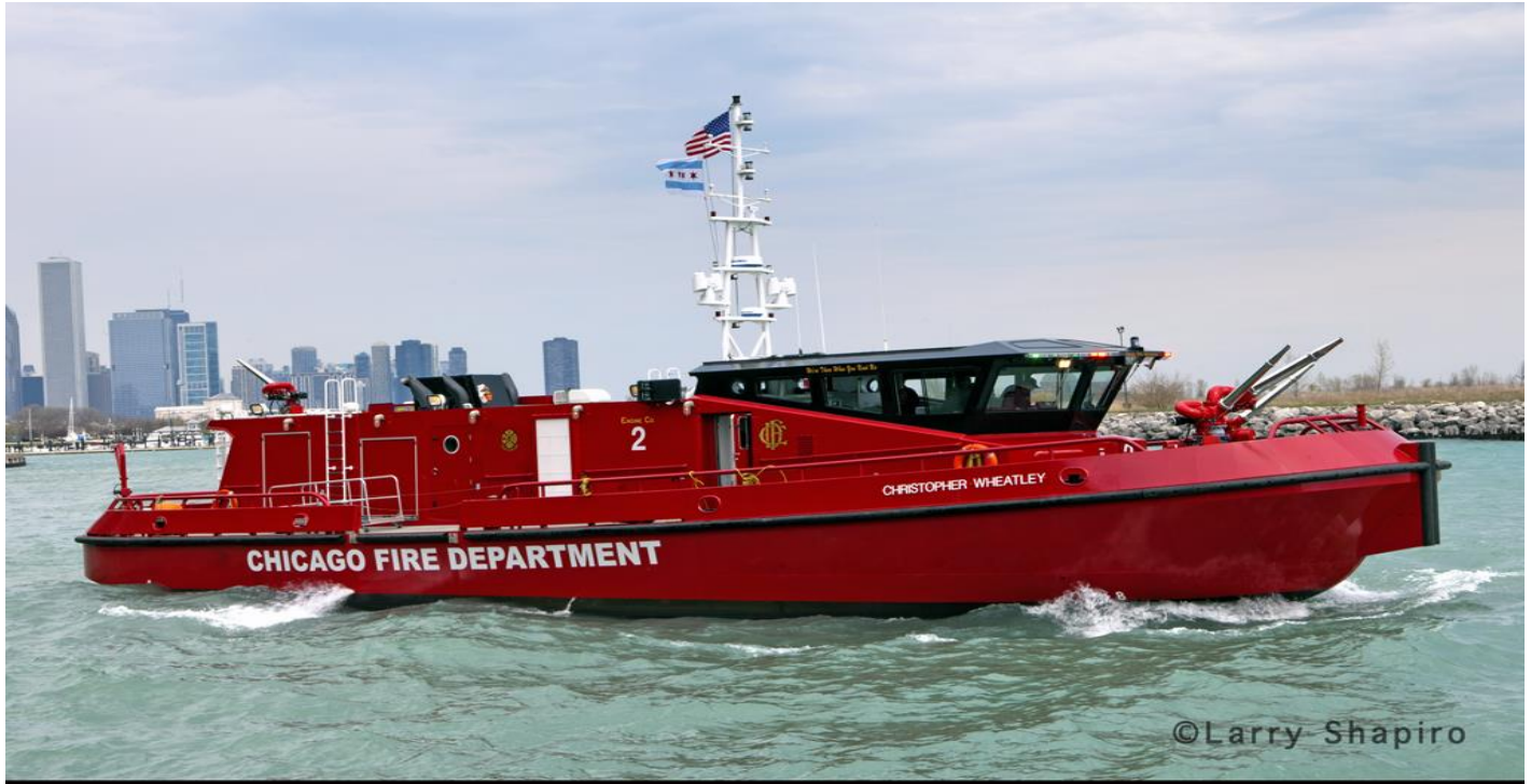
Engine 2 - 2011 Hike Metals 14,000 GPM Christopher Wheatley