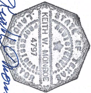
EXHIBIT OF 0.5228 ACRE (22,774 SQ. FT.) PORTION OF SARTORTIA ROAD WITHIN FORT BEND COUNTY TO BE ABANDONED IN THE J.H. CARTWRIGHT LEAGUE, A-16 FORT BEND COUNTY, TEXAS DECEMBER 2022 JOB NO. 2703-2012

(F) ● FND 5/8" IR W/CAP STAMPED "PINNELL 5349" (PS) ● 5/8" IR W/CAP STAMPED "LJA SURVEY" PREVIOUSLY SET P.O.B. POINT OF BEGINNING F.B.C.O.P.R. OFFICIAL PUBLIC RECORDS OF FORT BEND COUNTY, TEXAS F.B.C.O.R. OFFICIAL RECORDS OF FORT BEND COUNTY, TEXAS