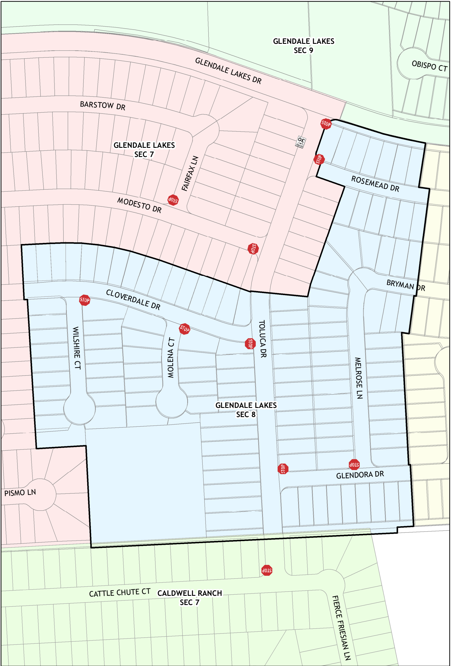
Glendale Lakes Section 8