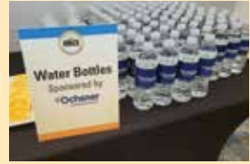
Design Your Own Sponsorship