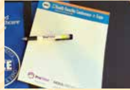
Conference Pens and Notepads