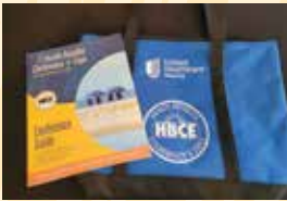
Keynote Session and Tote Bag