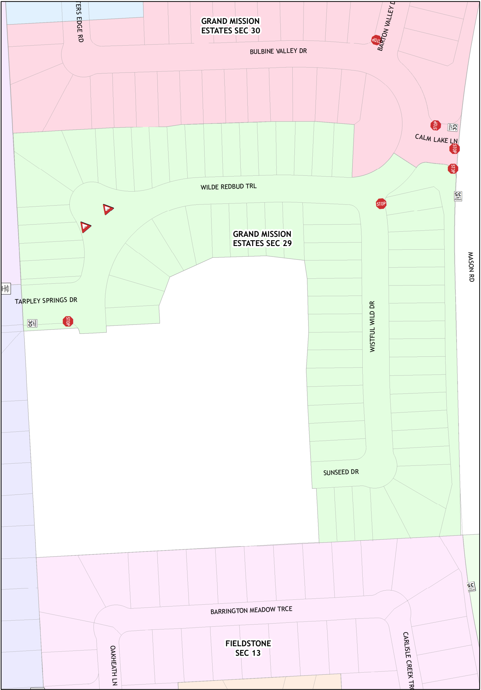
Grand Mission Estates, Section 29