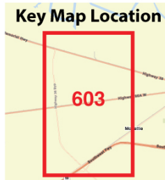
Key Map Location

CSJ: 0912-34-217 NBI: 12-080-0-AA0860-001 Location: Randon School Rd at Coon Creek Description of Work: Replace Bridge and Approaches Entity: Fort Bend County