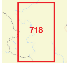
Key Map Location

CSJ: 0912-34-204 NBI: 12-080-0-AA0974-001 Location: Pleasant Rd (CR 267) at Cedar Creek Description of Work: Replace Bridge and Approaches Entity: Fort Bend County