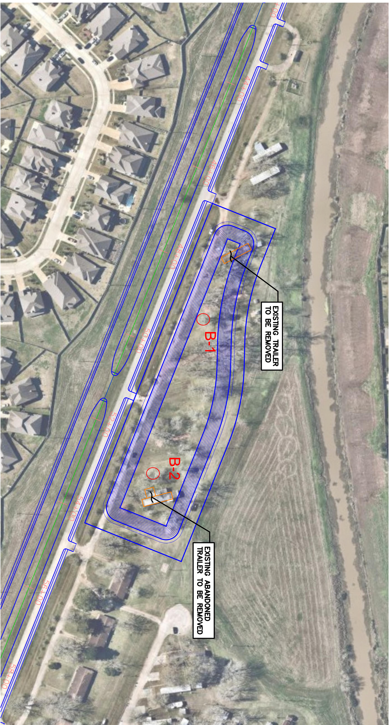
Figure Boring Location Plan