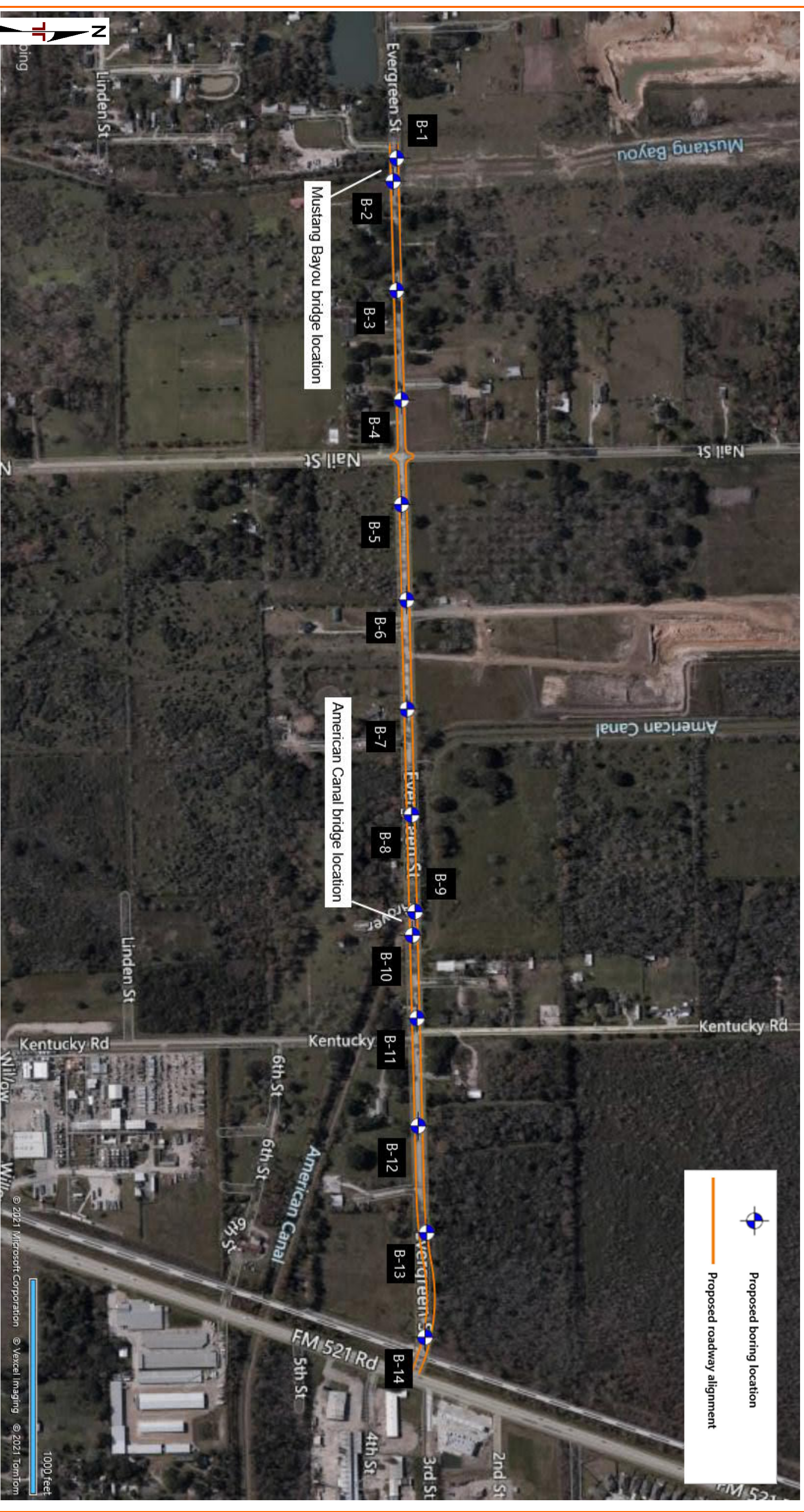
DIAGRAM IS FOR GENERAL LOCATION ONLY, AND IS NOT INTENDED FOR CONSTRUCTION PURPOSES