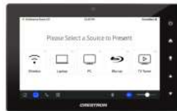
TSW-760-B-S 7 in. Touch Screen, Black Smooth