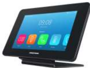
TST-902 8.7" Wireless Touch Screen