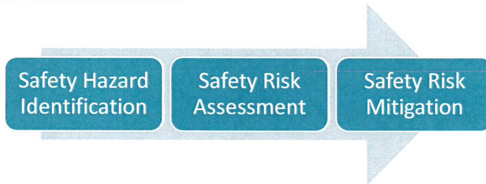
FIGURE 3: SAFETY RISK MANAGEMENT PROCESS

The implementation of the SRM component of the SMS will be carried out over the next year. The SRM components will be implemented through a program of improvement during which the SRM processes will be implemented, reviewed, evaluated, and revised as necessary, to ensure the processes are achieving the intended safety objectives as the processes are fully incorporated into Fort Bend Transit's standard operating procedures.