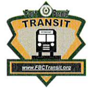
TABLE 1: AGENCY INFORMATION