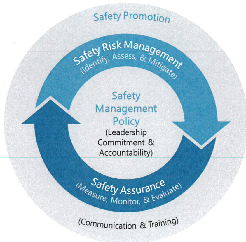
FIGURE 2: SAFETY MANAGEMENT SYSTEMS

SMS is comprised of four basic components - SMP, SRM, SA, and SP. The SMP and SP are the enablers that provide structure and supporting activities that make SRM and SA possible and sustainable. The SRM and SA are the processes and activities for effectively managing safety as presented in Figure 2.