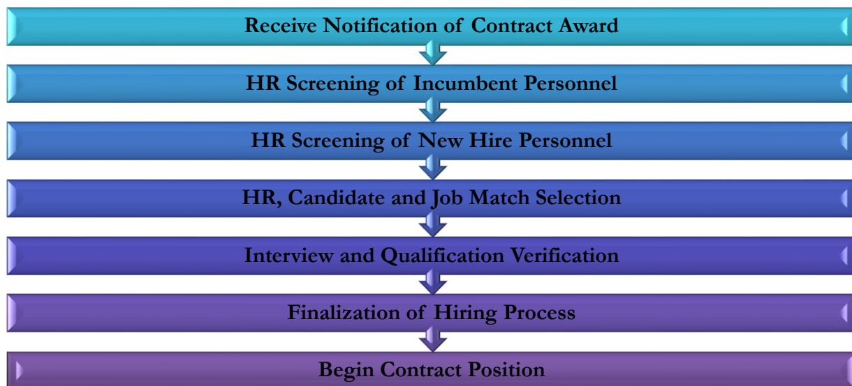
Figure 1-1, Recruiting Process

Furthermore, we actively seek contract personnel for all available positions by using the recruiting methods described below and shown in our recruiting process, illustrated in Figure 1-1 Recruiting Process .