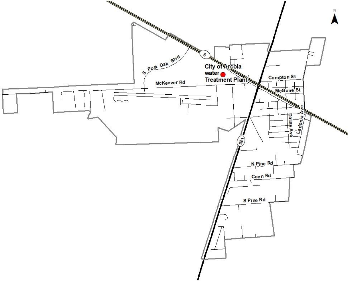
Exhibit B Site Map - City of Arcola Water Treatment Plant