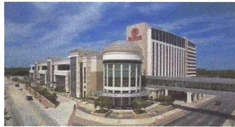
Shreveport Hilton Hotel and Convention Center

We invite you to join us at the 2020 SWTA Freedom Through Transit Annual Conference to be held February 23-26, 2020 in Shreveport, Louisiana. The Conference Planning Committee is now accepting applications for conference presentations. If you have a presentation you would like to share at this year's conference, please complete the following form. If you want to suggest someone to present and a specific topic, please provide the person's contact information and in the description box put: SUGGESTED and include your name.