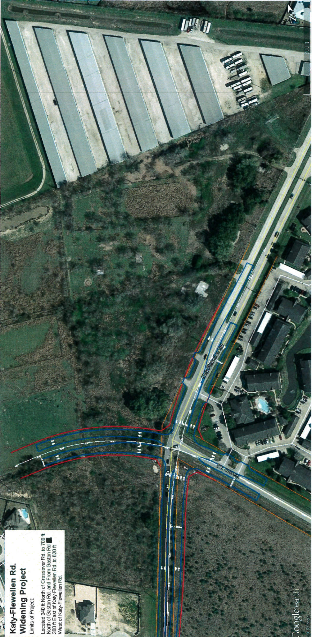
Katy-Flewellen Rd. Widening Project Limits of Project Located 340 ft North of Crossover Rd. to 700 ft North of Gaston Rd. and From Gaston Rd. 300 ft East of Katy-Flewellen Rd. to 820 ft West of Katy-Flewellen Rd.