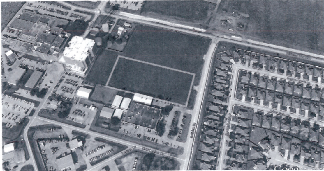
Existing Fort Bend County Juvenile Probation Department – Richmond, TX