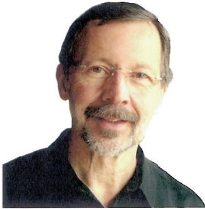
Ed Catmull President Pixar and Walt Disney Animation Studios and Disneytoon Studios