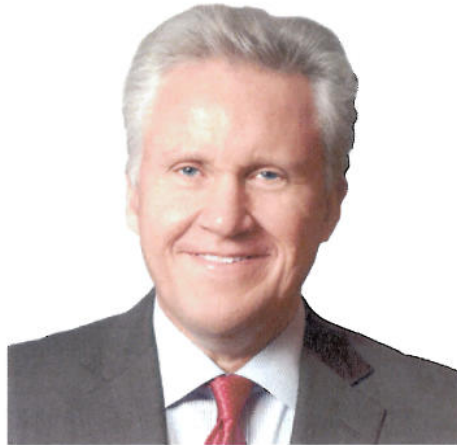
Jeffrey Immelt Chairman & CEO General Electric