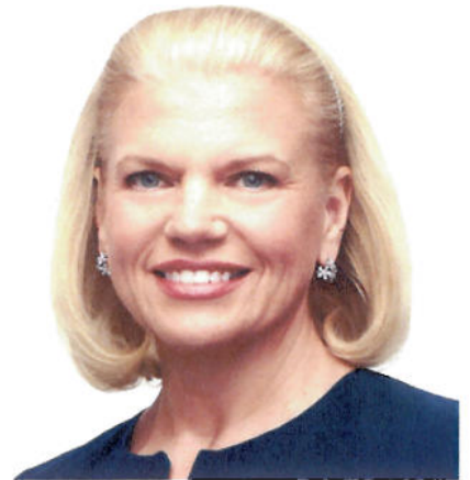
Ginni Rometty Chairman, President and CEO IBM