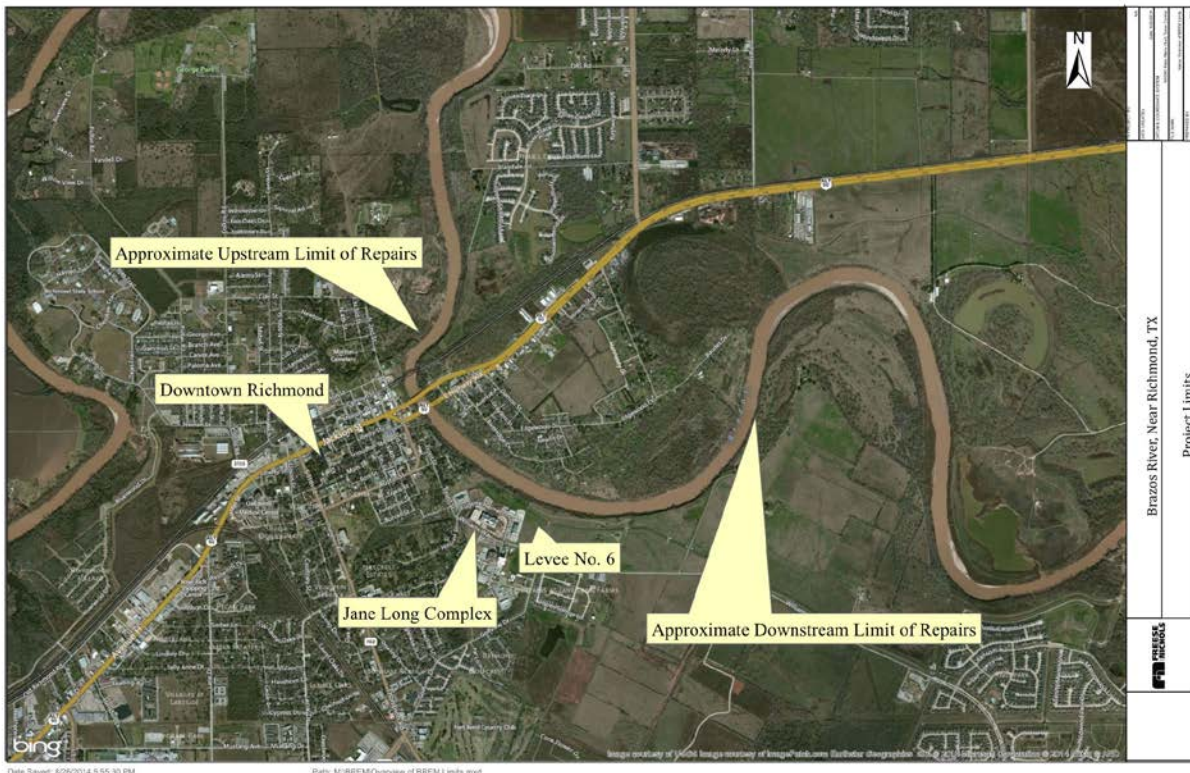
Figure 1 – Map of Study Area and Limits

Specific infrastructure within the project area include: US Highway 90A, Union Pacific Railroad Bridge, Fort Bend County Justice Center, Morton Cemetery, and Mirabeau B. Lamar Homestead Park and Archeological Site. This Statement of Work (SOW) is to help determine elements of this study, covering the limits of the Brazos River shown in Figure 1, which is approximately four river miles. The analyses will be documented in a memorandum and will be used to help guide investment in future phases of this project.