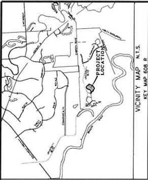
VICINITY MAP N.T.S. KEY MAP 608 R