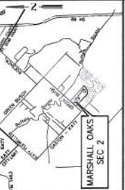
VICINITY MAP FORT BEND KEY MAP 4847