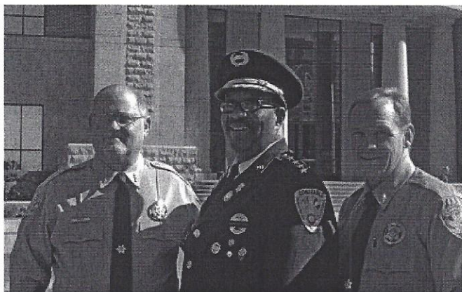
NCMA Texas 2013