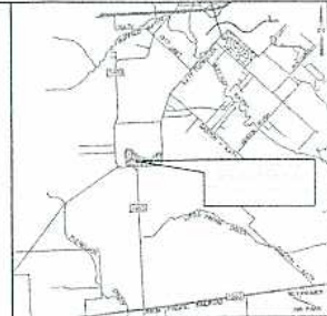
VICINITY MAP KEY MAP # 454 C