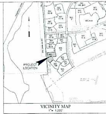
VICINITY MAP 1" = 1,200' KEY MAP NO. 649C